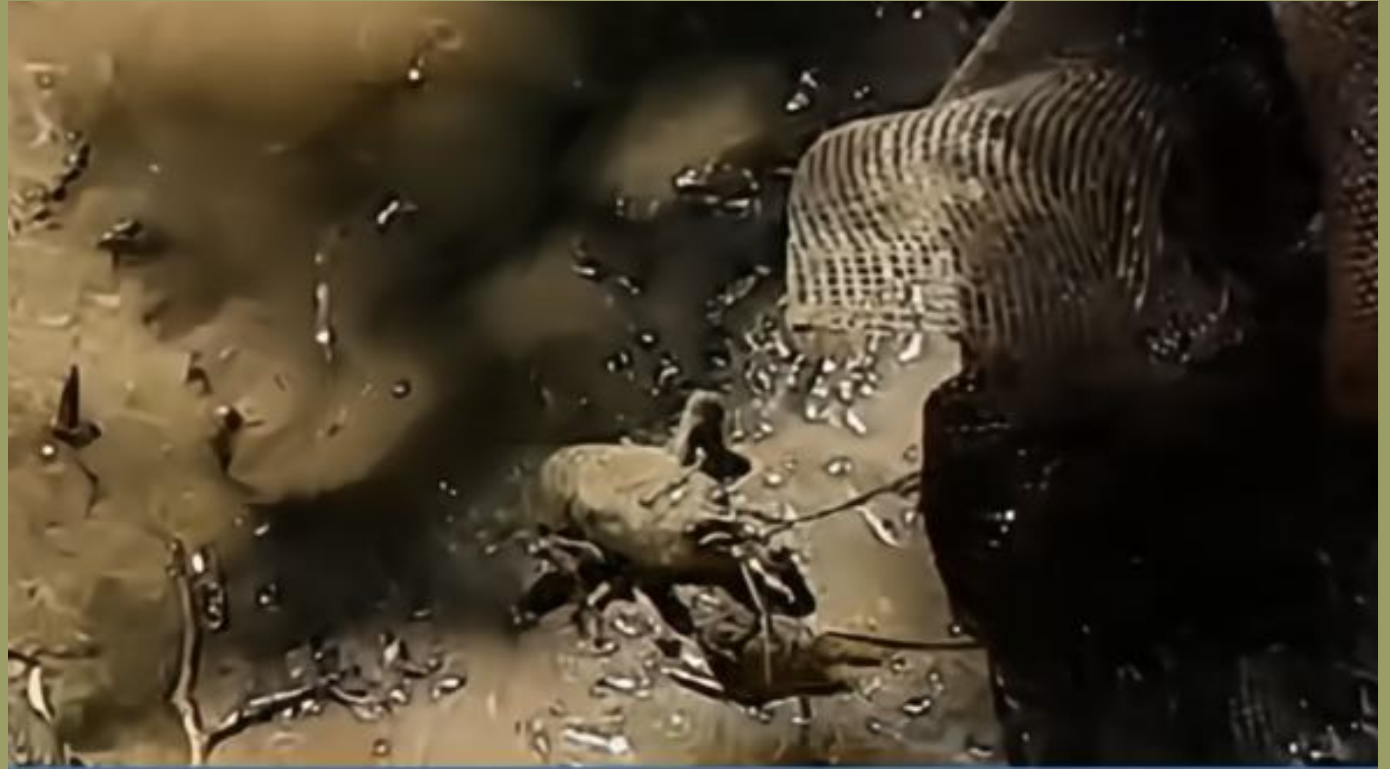
Stone crayfish being sucked up by a DPM pump (note the missing pincer)